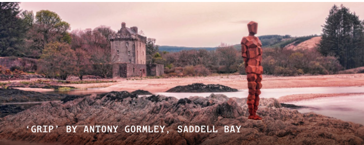
'GRIP' BY ANTONY GORMLEY, SADDLELL BAY