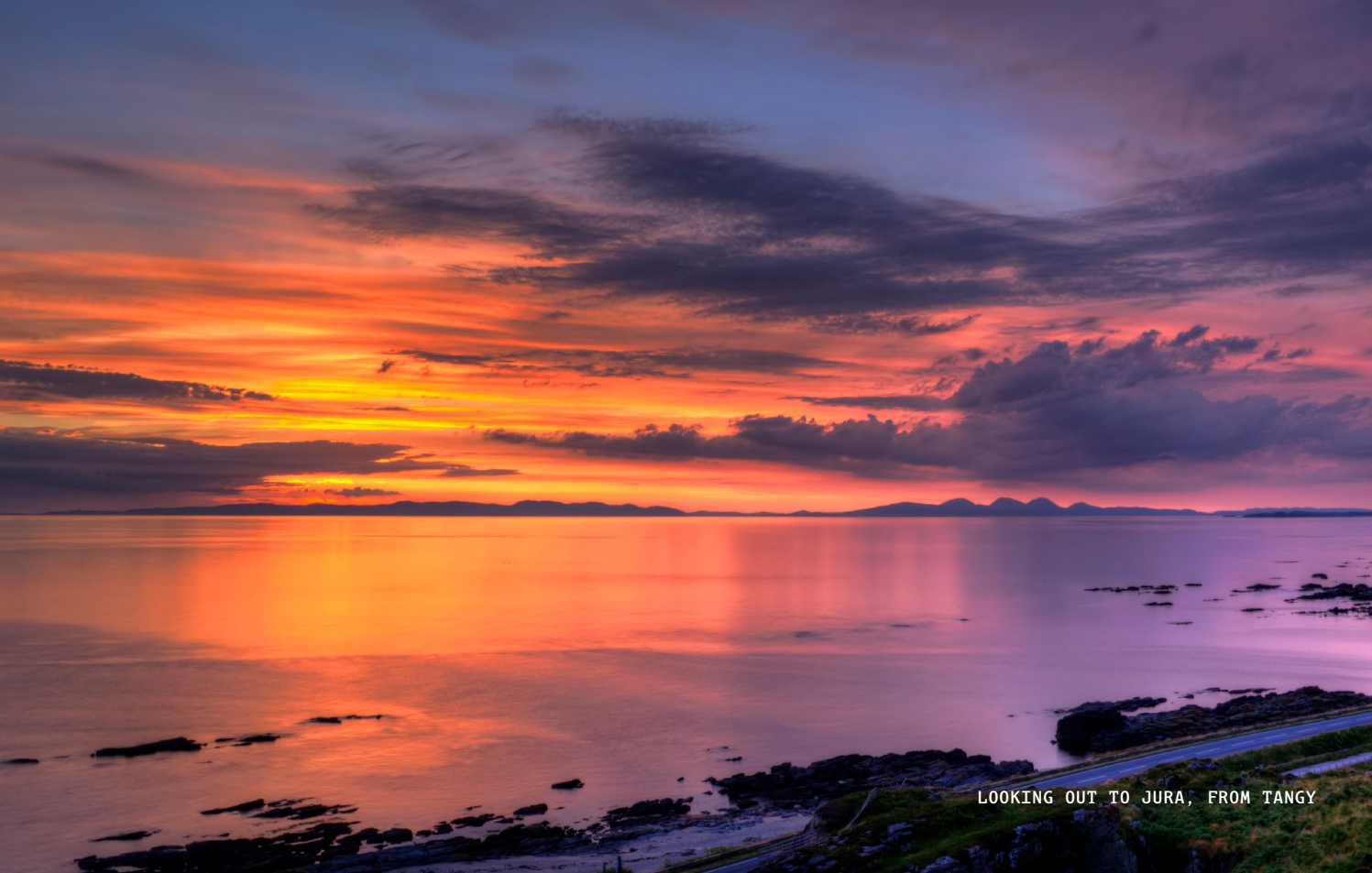
LOOKING OUT TO JURA, FROM TANGY